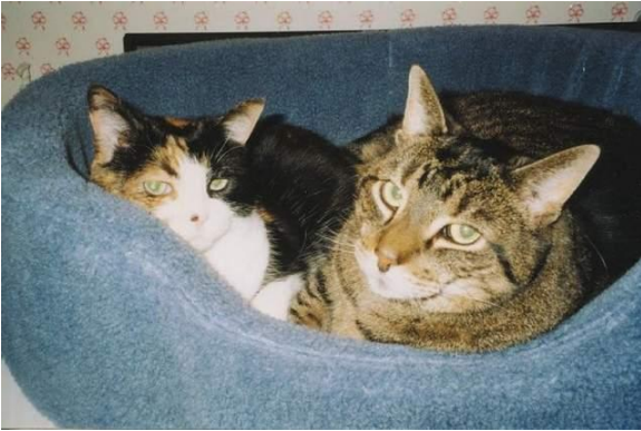
Purdy and Rocky -in cat heaven now - inspired the cat hospice concept.

Pets are living longer, just like people. But for pet families, this means facing sometimes difficult end-of-life decisions when pets get old, develop a serious illness or just need help getting around.